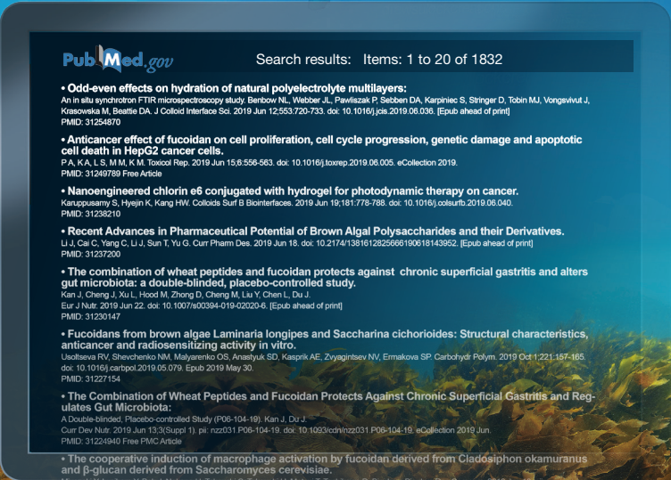
Check out PubMed.com to review multiple research papers on fucoidan.